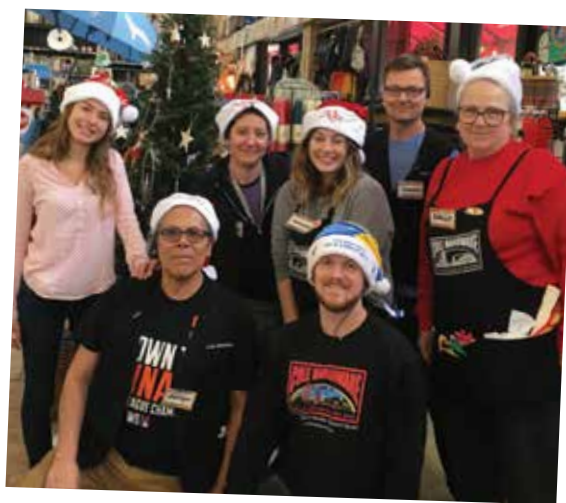
Our North Beach crew wishes you a happy holiday season!