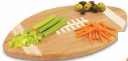
Cornerback Cutting Board (Sku 623006, $24.99)