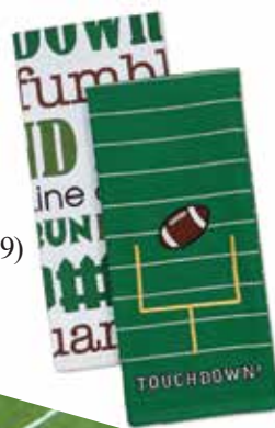
Touchdown Tea Towels, Set of 2 (Sku 698001, $12.99)