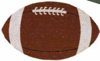
Dirt Defense Doormat (Sku 682038, $24.99) Fourth Street store only