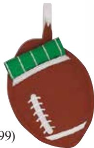
In-the-Pocket Potholder and Dish Towel Set (Sku 630031, $9.99)