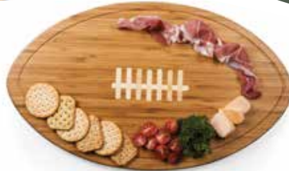
Play Action Platter (Sku 623005, $39.99)