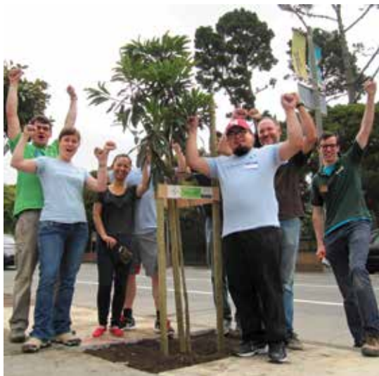
Last summer, Friends of the Urban Forest celebrated the planting of their 50,000th tree in San Francisco!

A tree-lined street makes for a more enjoyable walk, and currently, San Francisco’s tree canopy measures only 13.7%, while Oakland’s is only 15%—even Los Angeles boasts more than both cities at 21%! Certain trees that don’t uproot sidewalks are the best choice for urban areas, of course. In San Francisco, FUF can handle all of the details of providing you with your own sidewalk tree for a small fee.