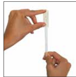
Stretch until tab releases from wall.