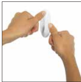
Slide hook up from mounting base.