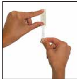
Pull tab straight down against wall.